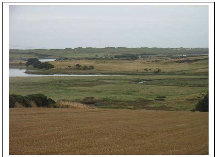
The Tarty Burn in the foreground, running into the Ythan Estuary behind. The burn is where we ring the greenshank as they feed and roost with the tide.