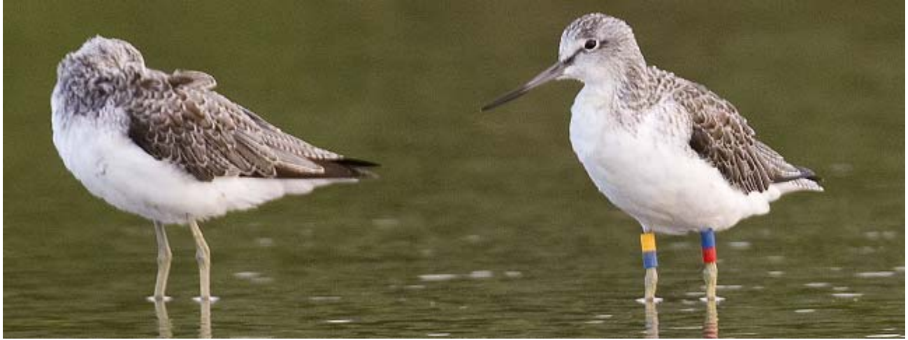
GREENSHANK – YB-BR at Walmsley Sanctuary